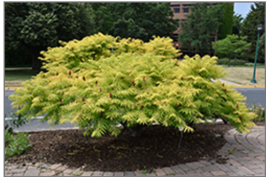
Tiger Eyes Sumac