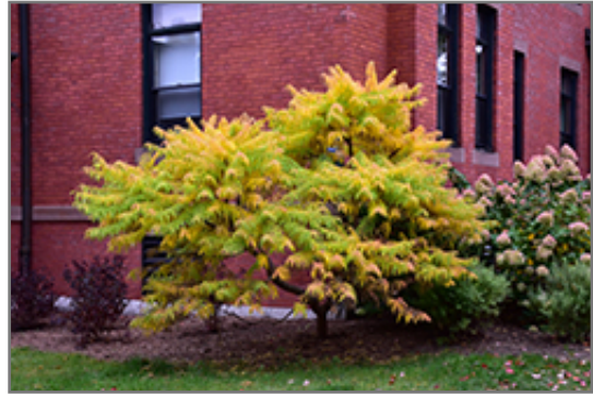
Tiger Eyes Sumac in fall