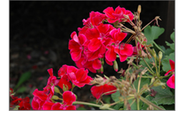
Calliope Crimson Flame Geranium flowers