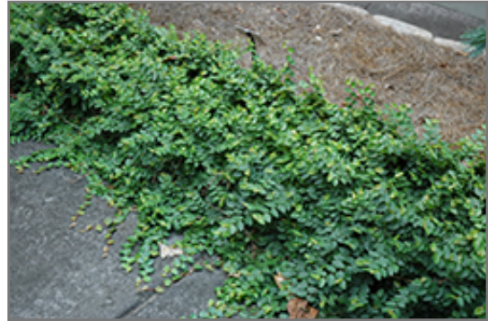
Creeping Fig

When grown indoors, Creeping Fig can be expected to grow to be about 8 feet tall at maturity, with a spread of 3 feet. It grows at a fast rate, and under ideal conditions can be expected to live for approximately 50 years. This houseplant performs well in both bright or indirect sunlight and strong artificial light, and can therefore be situated in almost any well-lit room or location. It does best in average to evenly moist soil, but will not tolerate standing water. The surface of the soil shouldn't be allowed to dry out completely, and so you should expect to water this plant once and possibly even twice each week. Be aware that your particular watering schedule may vary depending on its location in the room, the pot size, plant size and other conditions; if in doubt, ask one of our experts in the store for advice. It is not particular as to soil type or pH; an average potting soil should work just fine.