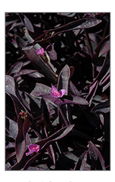
Purple Queen flowers

There are many factors that will affect the ultimate height, spread and overall performance of a plant when grown indoors; among them, the size of the pot it's growing in, the amount of light it receives, watering frequency, the pruning regimen and repotting schedule. Use the information described here as a guideline only; individual performance can and will vary. Please contact the store to speak with one of our experts if you are interested in further details concerning recommendations on pot size, watering, pruning, repotting, etc.