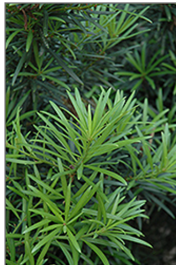
Japanese Yew foliage

When grown indoors, Japanese Yew can be expected to grow to be about 6 feet tall at maturity, with a spread of 3 feet. It grows at a slow rate, and under ideal conditions can be expected to live for approximately 50 years. This houseplant will do well in a location that gets either direct or indirect sunlight, although it will usually require a more brightly-lit environment than what artificial indoor lighting alone can provide. It does best in average to evenly moist soil, but will not tolerate standing water. The surface of the soil shouldn't be allowed to dry out completely, and so you should expect to water this plant once and possibly even twice each week. Be aware that your particular watering schedule may vary depending on its location in the room, the pot size, plant size and other conditions; if in doubt, ask one of our experts in the store for advice. It is not particular as to soil type or pH; an average potting soil should work just fine.