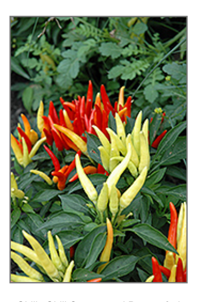
Chilly Chili Ornamental Pepper fruit

When grown indoors, Chilly Chili Ornamental Pepper can be expected to grow to be about 16 inches tall at maturity, with a spread of 18 inches. It grows at a medium rate, and under ideal conditions can be expected to live for approximately 1 years. This houseplant requires direct sun for optimal performance, and should therefore be situated in a room that gets bright sunlight for a good part of the day; it is not a good choice for rooms lit only by artificial light. It is very adaptable to both dry and moist soil, but will not tolerate any standing water. The surface of the soil shouldn't be allowed to dry out completely, and so you should expect to water this plant once and possibly even twice each week. Be aware that your particular watering schedule may vary depending on its location in the room, the pot size, plant size and other conditions; if in doubt, ask one of our experts in the store for advice. It is not particular as to soil type or pH; an average potting soil should work just fine.