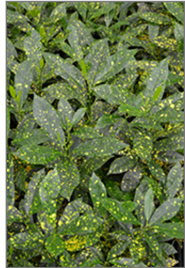
Gold Dust Variegated Croton foliage