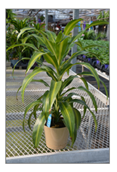
Hawaiian Sunshine Dracaena