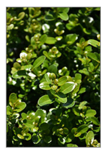
Sprinter Boxwood foliage