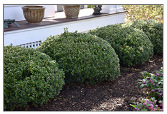
Sprinter Boxwood

This shrub does best in full sun to partial shade. You may want to keep it away from hot, dry locations that receive direct afternoon sun or which get reflected sunlight, such as against the south side of a white wall. It prefers to grow in average to moist conditions, and shouldn't be allowed to dry out. It is not particular as to soil type or pH. It is highly tolerant of urban pollution and will even thrive in inner city environments, and will benefit from being planted in a relatively sheltered location. This is a selected variety of a species not originally from North America.