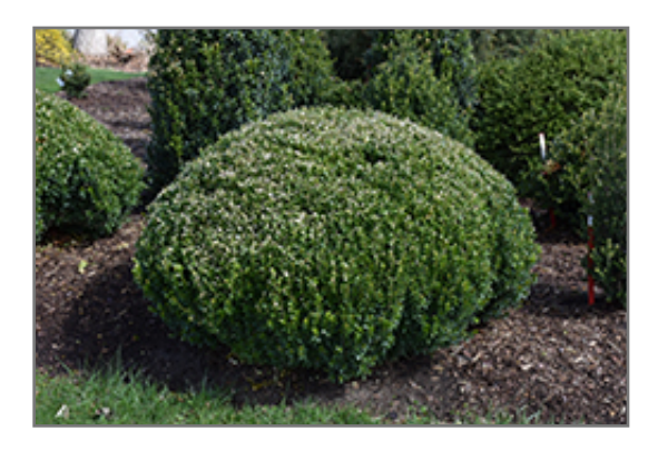
Sprinter Boxwood

Sprinter Boxwood is recommended for the following landscape applications;