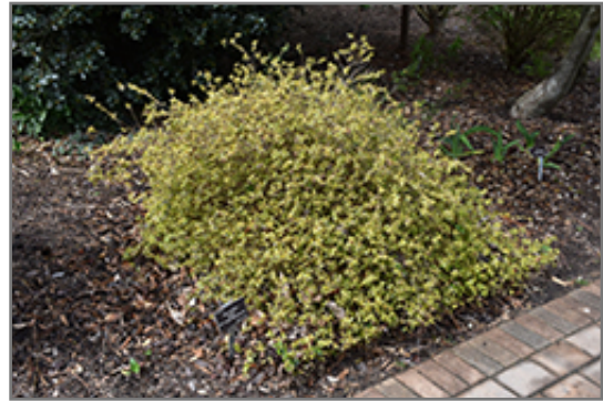
Twist of Orange Glossy Abelia