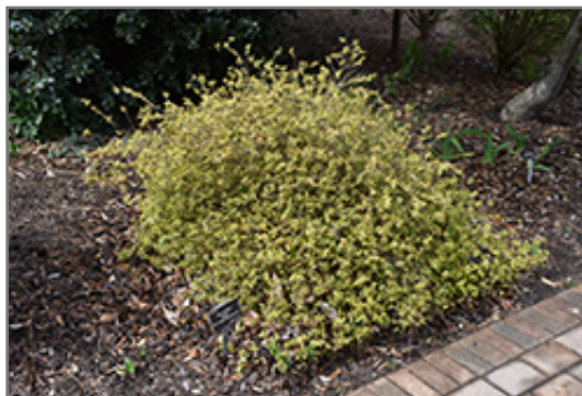
Twist of Orange Glossy Abelia