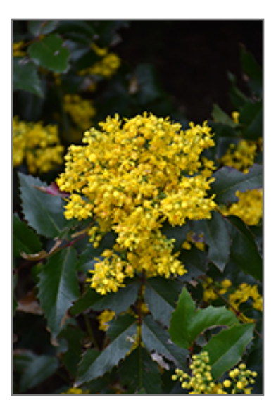
Oregon Grape flowers

Oregon Grape is recommended for the following landscape applications;