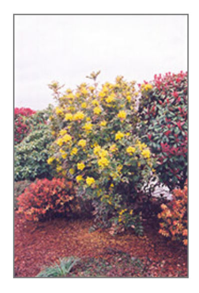
Oregon Grape in bloom