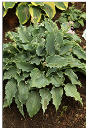
Shadowland Waterslide Hosta

Shadowland Waterslide Hosta is recommended for the following landscape applications;