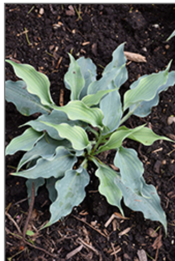
Shadowland Waterslide Hosta