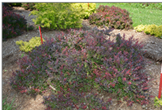
Sunjoy Todo Japanese Barberry

Sunjoy Todo Japanese Barberry will grow to be about 24 inches tall at maturity, with a spread of 24 inches. It tends to fill out right to the ground and therefore doesn't necessarily require facer plants in front. It grows at a medium rate, and under ideal conditions can be expected to live for approximately 20 years.