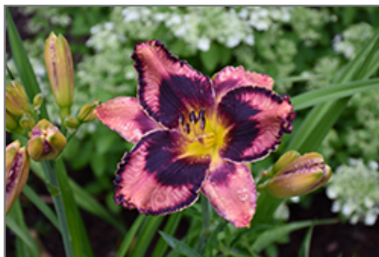
Rainbow Rhythm Storm Shelter Daylily flowers