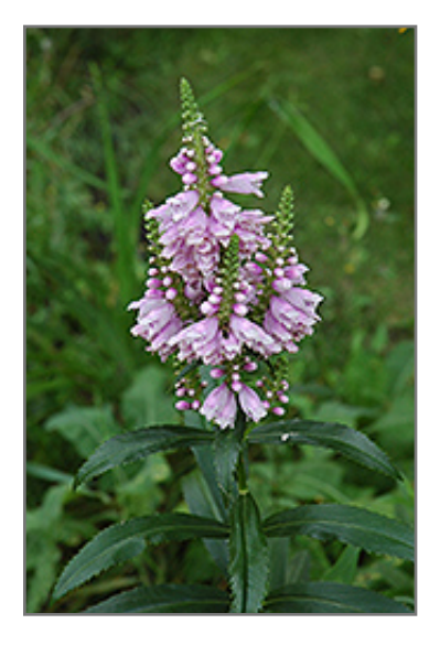
Obedient Plant flowers