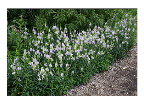
Obedient Plant in bloom