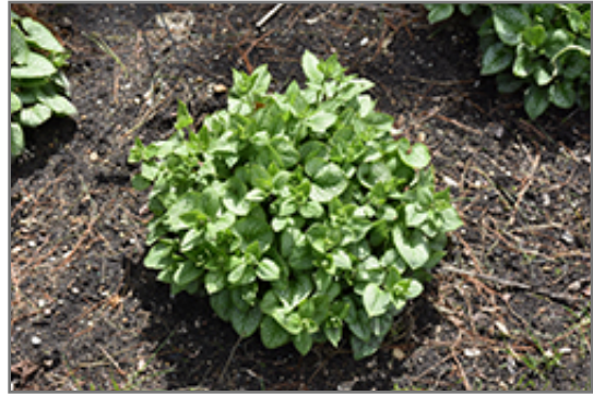
Jack of Diamonds Bugloss

Jack of Diamonds Bugloss will grow to be about 14 inches tall at maturity, with a spread of 30 inches. When grown in masses or used as a bedding plant, individual plants should be spaced approximately 28 inches apart. It grows at a medium rate, and under ideal conditions can be expected to live for approximately 10 years. As an herbaceous perennial, this plant will usually die back to the crown each winter, and will regrow from the base each spring. Be careful not to disturb the crown in late winter when it may not be readily seen!