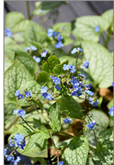
Jack of Diamonds Bugloss flowers

Jack of Diamonds Bugloss is recommended for the following landscape applications;