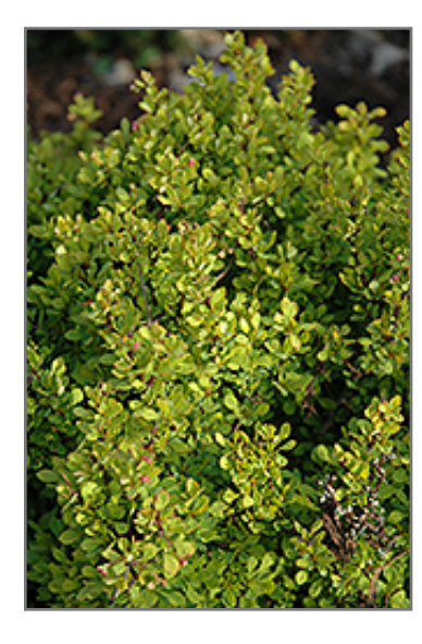
Golden Nugget Japanese Barberry foliage