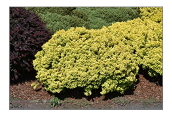
Golden Nugget Japanese Barberry

Golden Nugget Japanese Barberry is recommended for the following landscape applications;