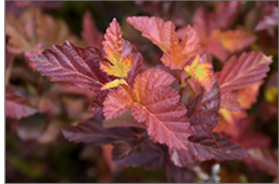
Center Glow Ninebark foliage

Center Glow Ninebark is recommended for the following landscape applications;