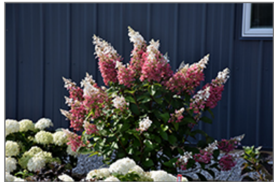
Pinky Winky Hydrangea in bloom