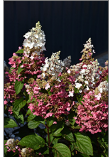
Pinky Winky Hydrangea flowers