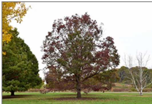
White Oak in fall

White Oak will grow to be about 90 feet tall at maturity, with a spread of 70 feet. It has a high canopy of foliage that sits well above the ground, and should not be planted underneath power lines. As it matures, the lower branches of this tree can be strategically removed to create a high enough canopy to support unobstructed human traffic underneath. It grows at a slow rate, and under ideal conditions can be expected to live to a ripe old age of 300 years or more; think of this as a heritage tree for future generations!