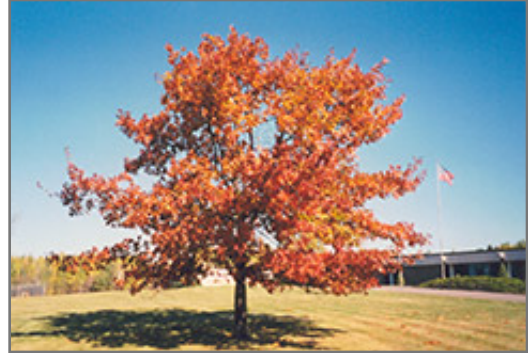
Red Oak in fall