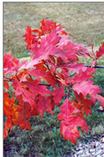
Red Oak in fall

This tree should only be grown in full sunlight. It prefers to grow in average to moist conditions, and shouldn't be allowed to dry out. It is not particular as to soil type, but has a definite preference for acidic soils, and is subject to chlorosis (yellowing) of the leaves in alkaline soils. It is highly tolerant of urban pollution and will even thrive in inner city environments. This species is native to parts of North America.