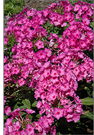
Pink Flame Garden Phlox flowers