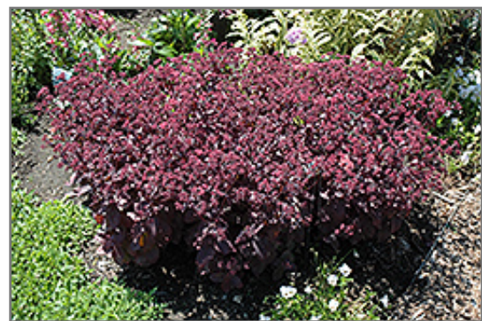
Xenox Stonecrop in bloom