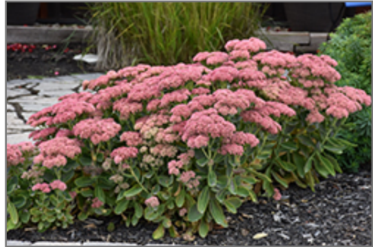
Autumn Fire Stonecrop in bloom

Autumn Fire Stonecrop is recommended for the following landscape applications;