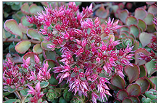
Fuldaglut Stonecrop flowers