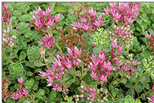
John Creech Stonecrop flowers

John Creech Stonecrop is recommended for the following landscape applications;