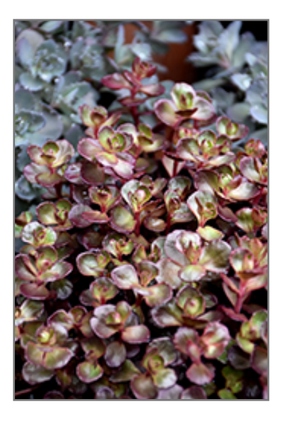
Voodoo Stonecrop foliage

Voodoo Stonecrop is recommended for the following landscape applications;