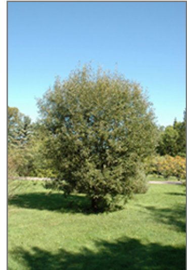
Pussy Willow