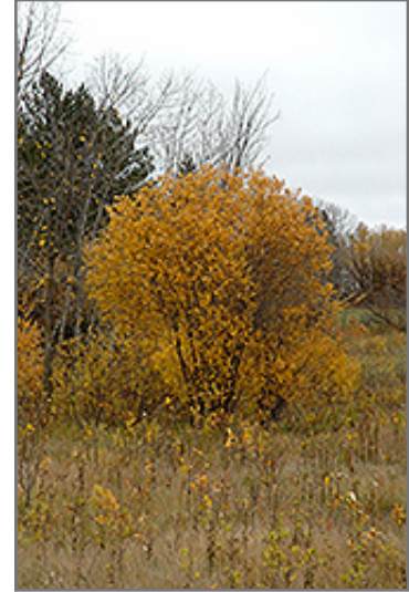
Pussy Willow in fall

* This is a 'special order' plant - contact store for details