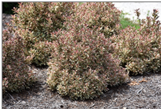
My Monet Weigela

My Monet Weigela makes a fine choice for the outdoor landscape, but it is also well-suited for use in outdoor pots and containers. It is often used as a 'filler' in the 'spiller-thriller-filler' container combination, providing a mass of flowers and foliage against which the thriller plants stand out. Note that when grown in a container, it may not perform exactly as indicated on the tag - this is to be expected. Also note that when growing plants in outdoor containers and baskets, they may require more frequent waterings than they would in the yard or garden.