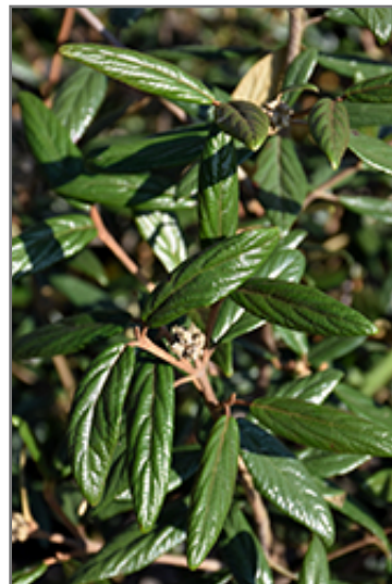
Prague Viburnum foliage

This shrub does best in full sun to partial shade. It prefers to grow in average to moist conditions, and shouldn't be allowed to dry out. It is not particular as to soil type or pH. It is highly tolerant of urban pollution and will even thrive in inner city environments. This particular variety is an interspecific hybrid.