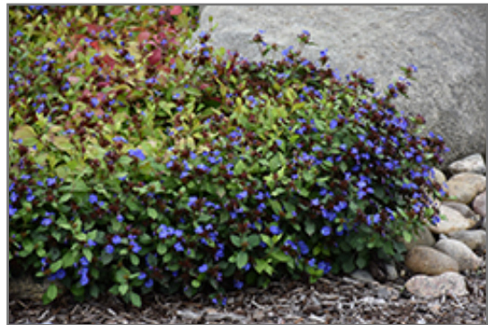
Plumbago in bloom