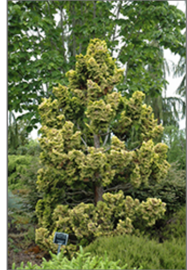
Dwarf Golden Hinoki Falsecypress