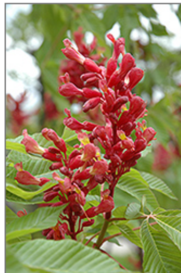
Red Buckeye flowers