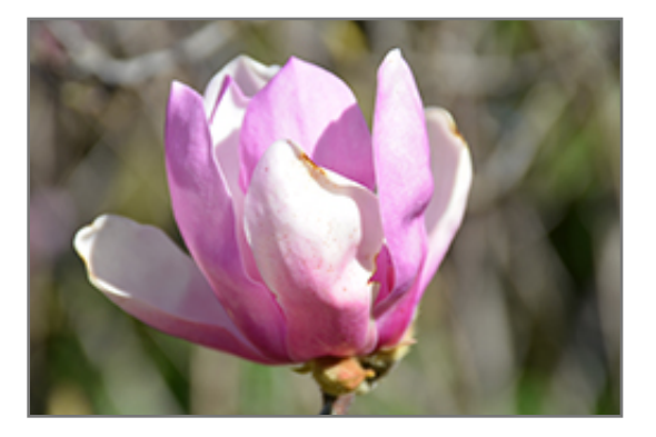
Jane Magnolia flowers Photo courtesy of NetPS Plant Finder

Jane Magnolia in bloom Photo courtesy of NetPS Plant Finder