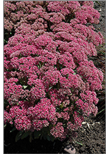
Mr. Goodbud Stonecrop flowers

Mr. Goodbud Stonecrop is recommended for the following landscape applications;