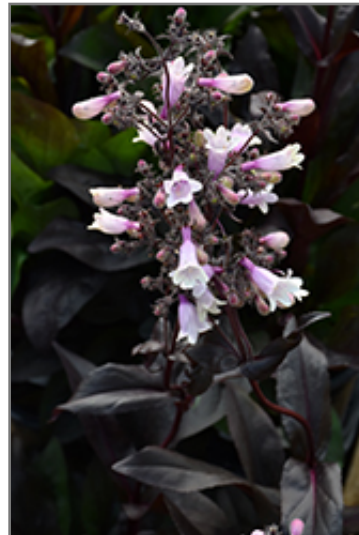
Dark Towers Beard Tongue flowers