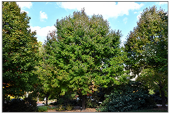
Autumn Flame Red Maple

This tree should only be grown in full sunlight. It is quite adaptable, preferring to grow in average to wet conditions, and will even tolerate some standing water. It is not particular as to soil type, but has a definite preference for acidic soils, and is subject to chlorosis (yellowing) of the foliage in alkaline soils. It is somewhat tolerant of urban pollution. This is a selection of a native North American species.