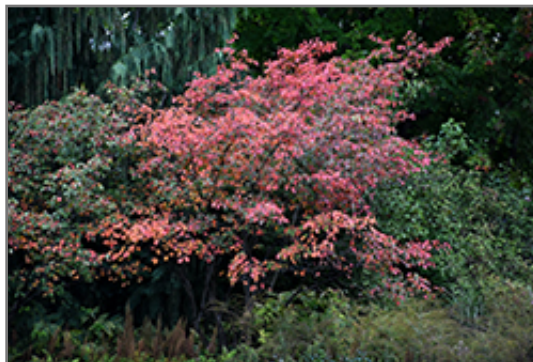
Autumn Brilliance Serviceberry in fall

This tree does best in full sun to partial shade. It prefers to grow in average to moist conditions, and shouldn't be allowed to dry out. It is not particular as to soil type or pH. It is somewhat tolerant of urban pollution. This particular variety is an interspecific hybrid.