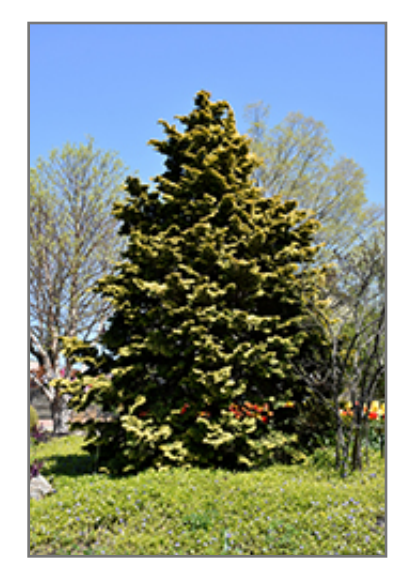
Confucius Hinoki Falsecypress