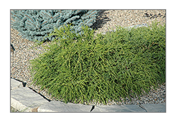
Mops Falsecypress