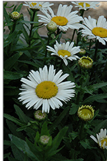
Snow Lady Shasta Daisy flowers