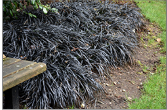
Black Mondo Grass