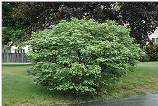
Compact Winged Burning Bush

Compact Winged Burning Bush will grow to be about 7 feet tall at maturity, with a spread of 7 feet. It tends to fill out right to the ground and therefore doesn't necessarily require facer plants in front, and is suitable for planting under power lines. It grows at a slow rate, and under ideal conditions can be expected to live for 50 years or more.