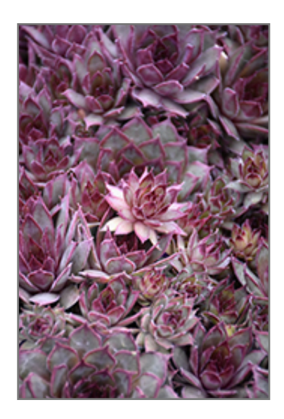
Red Beauty Hens And Chicks foliage