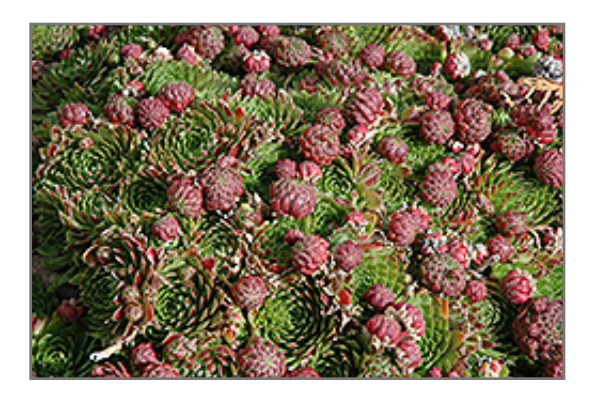
Red Beauty Hens And Chicks