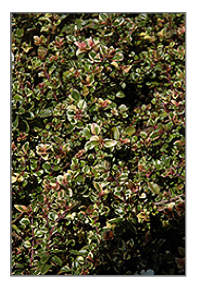
Variegated Broadleaf Thyme foliage