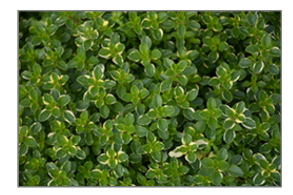
Variegated Broadleaf Thyme foliage