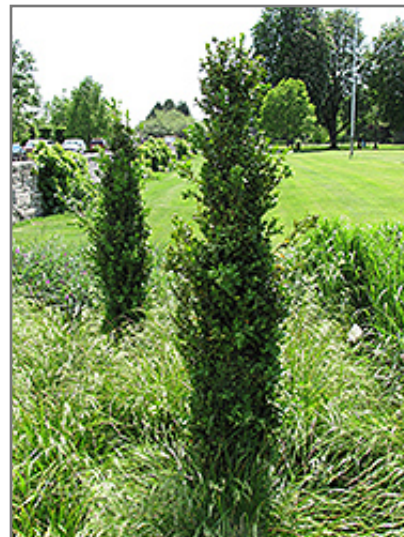
Graham Blandy Boxwood