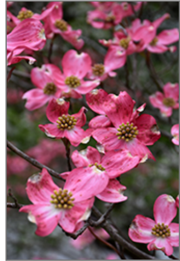
Cherokee Chief Flowering Dogwood flowers

This is a relatively low maintenance tree, and usually looks its best without pruning, although it will tolerate pruning. It is a good choice for attracting birds to your yard. Gardeners should be aware of the following characteristic(s) that may warrant special consideration;