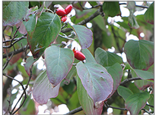
Cherokee Chief Flowering Dogwood fruit

This tree does best in full sun to partial shade. You may want to keep it away from hot, dry locations that receive direct afternoon sun or which get reflected sunlight, such as against the south side of a white wall. It requires an evenly moist well-drained soil for optimal growth, but will die in standing water. It is very fussy about its soil conditions and must have rich, acidic soils to ensure success, and is subject to chlorosis (yellowing) of the foliage in alkaline soils. It is quite intolerant of urban pollution, therefore inner city or urban streetside plantings are best avoided, and will benefit from being planted in a relatively sheltered location. Consider applying a thick mulch around the root zone in winter to protect it in exposed locations or colder microclimates. This is a selection of a native North American species.