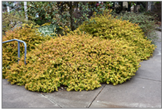
Kaleidoscope Abelia

Kaleidoscope Abelia will grow to be about 30 inches tall at maturity, with a spread of 4 feet. It tends to fill out right to the ground and therefore doesn't necessarily require facer plants in front. It grows at a slow rate, and under ideal conditions can be expected to live for approximately 30 years.