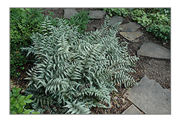
Japanese Painted Fern