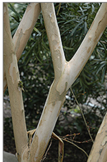
Zuni Crapemyrtle bark

Zuni Crapemyrtle makes a fine choice for the outdoor landscape, but it is also well-suited for use in outdoor pots and containers. Because of its height, it is often used as a 'thriller' in the 'spiller-thriller-filler' container combination; plant it near the center of the pot, surrounded by smaller plants and those that spill over the edges. It is even sizeable enough that it can be grown alone in a suitable container. Note that when grown in a container, it may not perform exactly as indicated on the tag - this is to be expected. Also note that when growing plants in outdoor containers and baskets, they may require more frequent waterings than they would in the yard or garden.