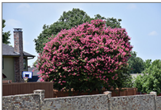
Zuni Crapemyrtle in bloom